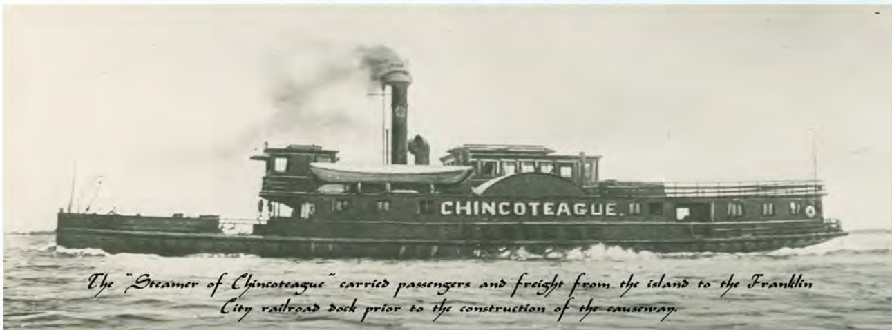
The "Steamer of Chincoteague" carried passengers and freight from the island to the Franklin City railroad dock prior to the construction of the causeway.

The town's population is approximately 3,000 and life on the island has changed in many ways. The primary economy has evolved over the years from farming to seafood and finally, to tourism. This tour guide will help show you Chincoteague's rich history and help provide a glimpse into the way life once was on this historic and unique island.