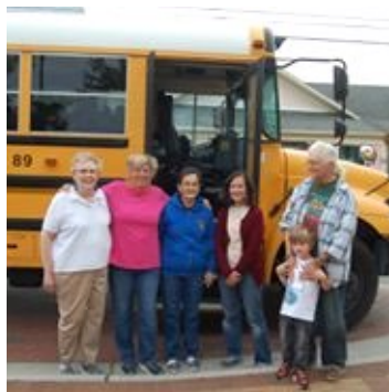
Accomack Co. School Bus