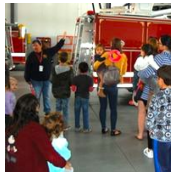
Visit to new CVFC

"Lubbock's Learners": Summer Reading Challenge for K - 12 students began May 15 until August 15. Students were encouraged to read at home, log their time, and enter a drawing for prizes. A bag of school supplies was given to all students who completed the program. This program is made possible through the generosity of the owners of Lubbock, a beloved pet who passed away in 2018.