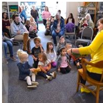
A Visit to the Museum